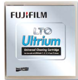
Fujifilm's Ultrium Universal Cleaning Cartridge is designed for use with all Ultrium 1, 2, 3, 4 & 5 tape drives.

To learn more about Fujifilm's Value-Added Services, such as custom barcode labeling for Fujifilm data media products visit www.fujifilmusa.com/tapestorage